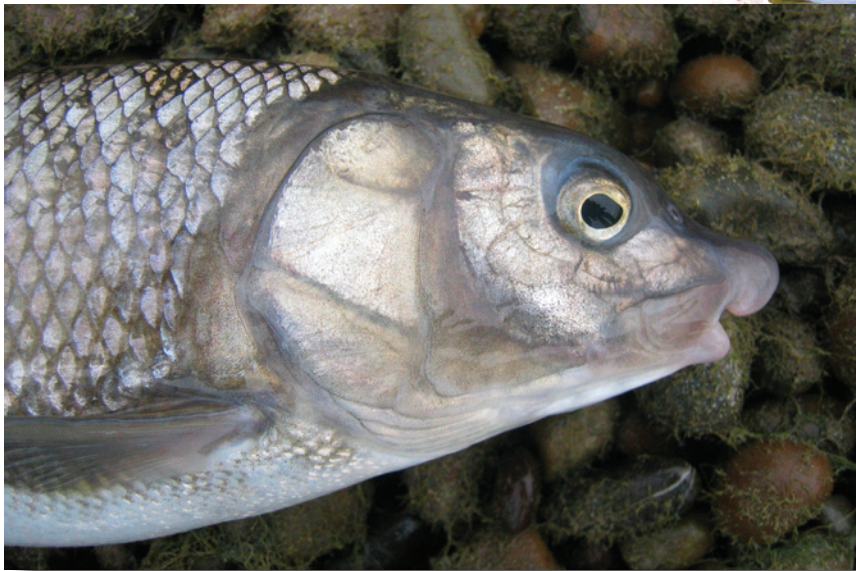
Evin Oneale, IDFG

Mountain whitefish are best pursued using small hooks fished near the bottom of deep pools