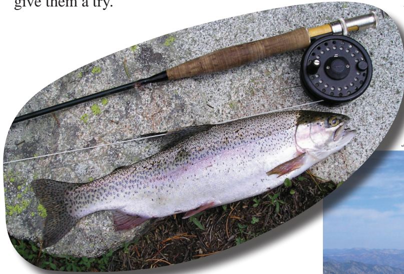
Joe Kozfay, IDFG

Idaho has more than 3,000 alpine lakes of which about 1,300 are stocked or have natural fish populations. Fish and Game typically stocks these lakes via airplane, but some lakes are stocked by horseback or backpack. Stocked species include rainbow trout, grayling, golden trout, and cutthroat trout to name a few. Some of these fish species are exclusive to mountain lakes – yet another reason to give them a try.