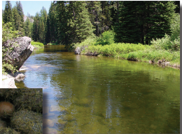
Evin Oneale, IDFG

Although whitefish do not jump like a trout when on the end of your line, they do put up a pretty fair fight. To target whitefish with a rod and reel, remember that they tend to run in schools during most of the year, usually in pools and deeper runs below fast water riffles. In winter months, this schooling behavior becomes even stronger. So when you find one whitefish, you have probably found a bunch.