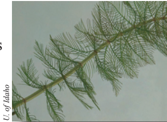
U. of Idaho

Eurasian water-milfoil is a non-native aquatic plant that arrived in the U.S. in the 1940s and has now spread across the country, including Idaho. This nuisance plant grows fast and can quickly cover the entire surface of smaller lakes and ponds, making fishing and boating impossible.