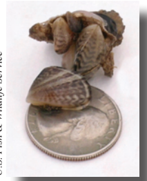
U.S. Fish & Wildlife Service

are the newest threat. First seen in the Great Lakes in the 1980s, both species quickly expanded through much of the Midwest and more recently to the western U.S. They thrive in reservoirs, lakes and larger rivers, attaching to rocks, ropes, chains, docks, dams, irrigation pipes and even boat hulls and motors. Filtering algae from the water, they can disrupt the food chain which then impacts fish populations. Spreading can occur when an infested boat is moved from one water to another.